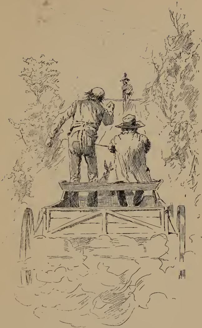
CHASING THE BICYCLE